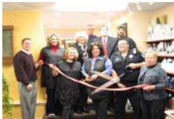
The ribbon is cut at Shear Heaven Salon & Day Spa's, new expanded location at 168 N. Main St. in Rutland.